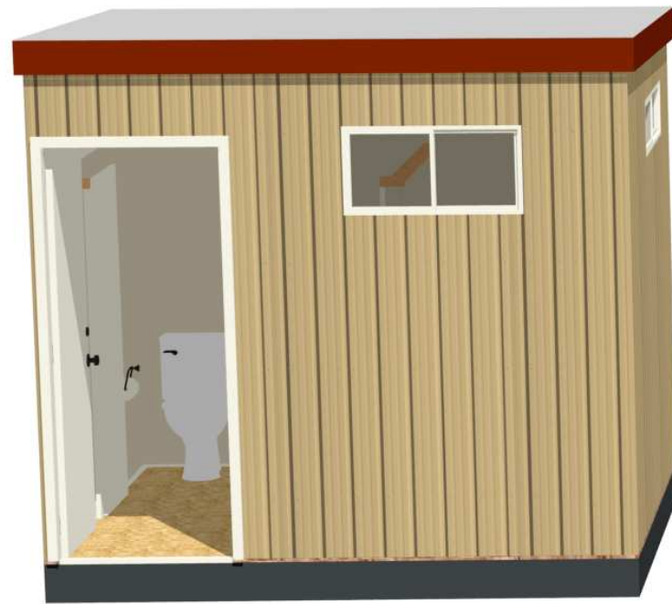
3D Exterior View

1, Viaduct Place Drouin VIC 3818 Ph: 03 5625 3333 Fax: 03 5625 5245