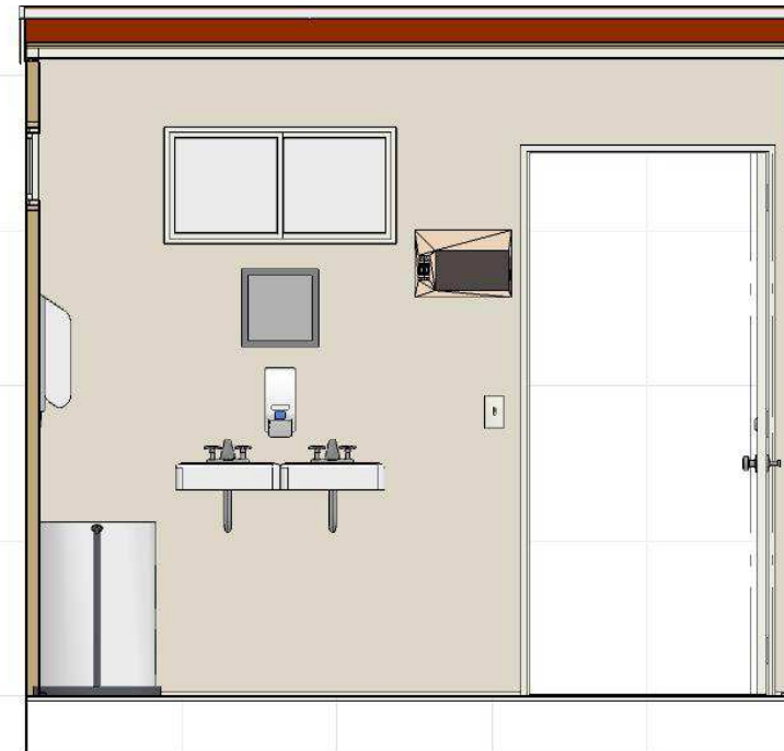
Interior Elevation (Hand Basin Wall)